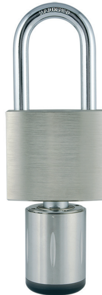
TRAC-Guard padlock with 2-inch shackle

Mobile phones provisioned with the TRACcess eKEY ® app transform operations by bringing online capabilities to offline locations. Activity data is used to monitor job status, or confirm that vendors arrived to maintain equipment. The keys deliver system information to the lock, eliminating trips to reprogram or rekey locks. Contractors receive credentials by cell communications, so no staff is needed to admit vendors.